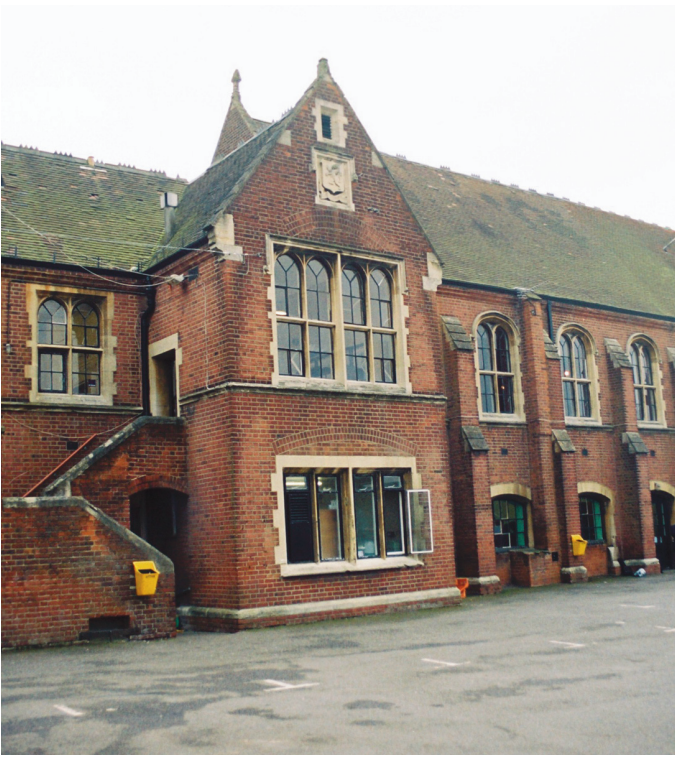
THE JOHN LYON SCHOOL